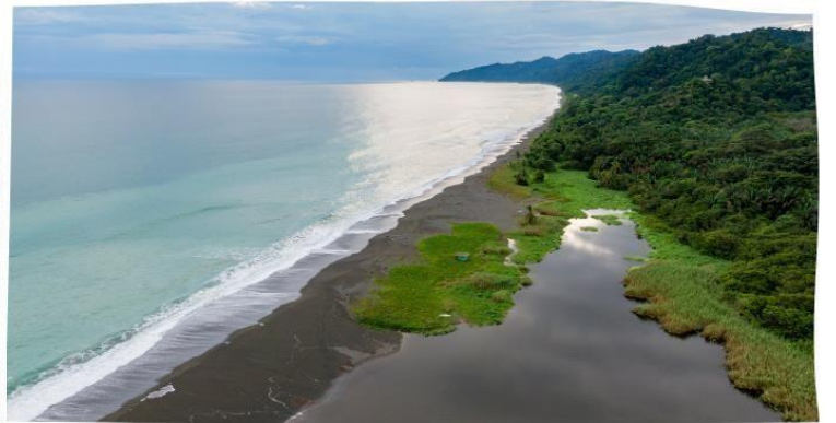
A taste of what to expect!